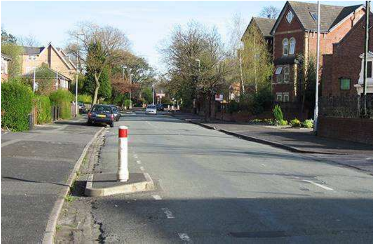
Photograph of typical build-out